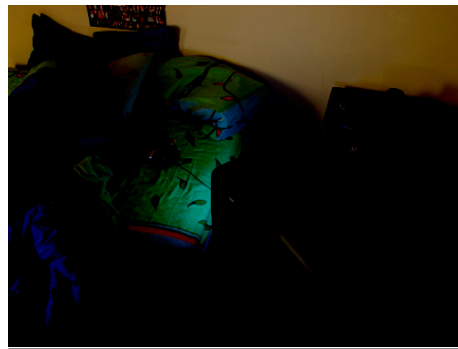
Underexposed (-1 EV) by one full F-stop or Shutter Speed

Three shots of the same exact frame, intentionally shooting one normal, one under-exposed, and one over-exposed frame by adjusting either the Aperture (if shutter priority) OR Shutter Speed (if aperture priority).