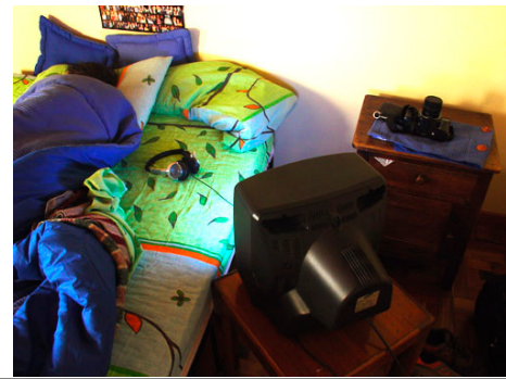
Overexposed (+1 EV) by one full F-stop or Shutter Speed