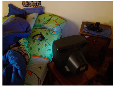
Light meter at Zero Correct exposure according to light meter